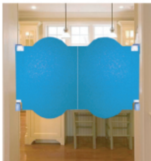
Ruff Tuff II Cafe Doors